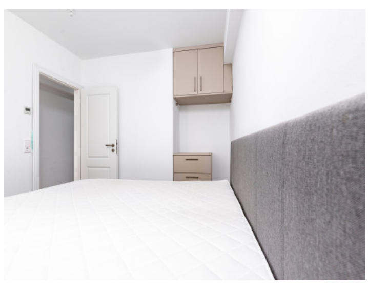
All information is correct to the best of our knowledge. Errors and prior sale excepted. This prospectus is purely for information purposes. Only the notarized deed of sale is legally binding.