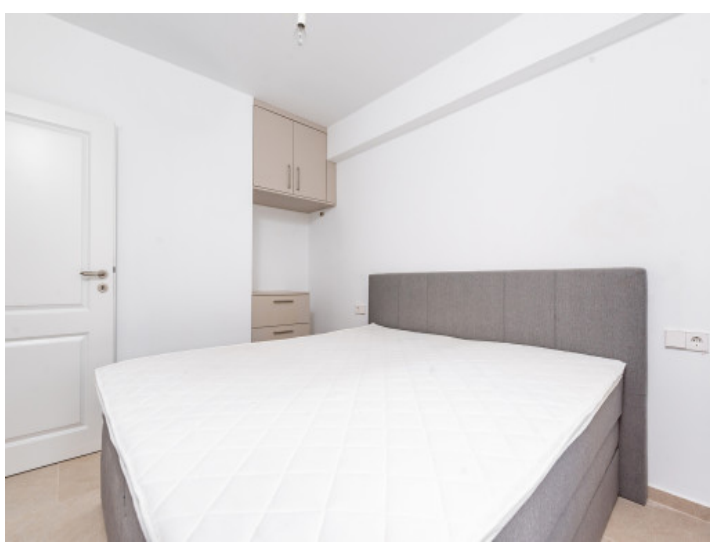
All information is correct to the best of our knowledge. Errors and prior sale excepted. This prospectus is purely for information purposes. Only the notarized deed of sale is legally binding.