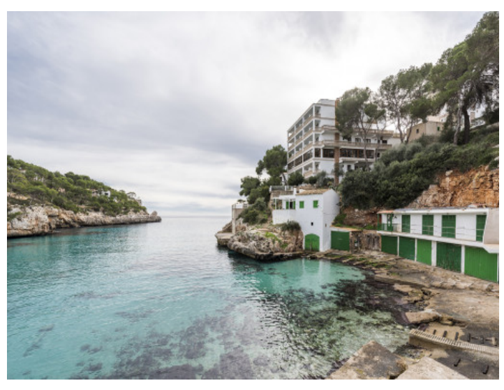
All information is correct to the best of our knowledge. Errors and prior sale excepted. This prospectus is purely for information purposes. Only the notarized deed of sale is legally binding.