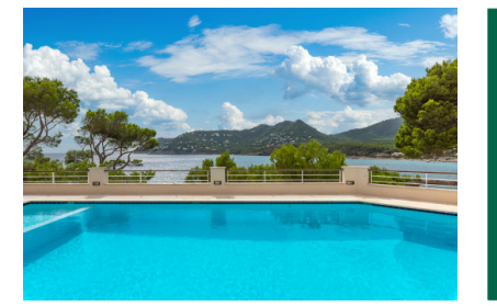
PORTA MALLORQUINA<sup>®</sup> Your home. Our passion.