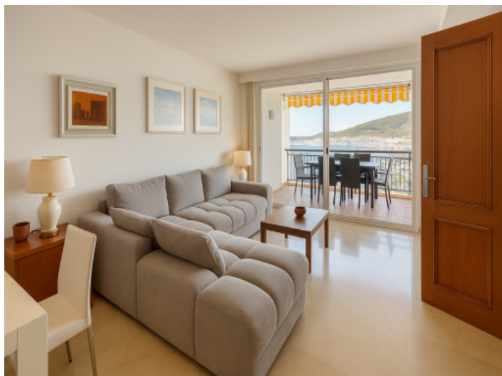
Living room with sea views and access to the balcony