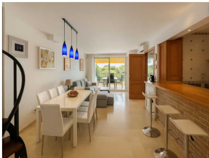
Dining area and American kitchen