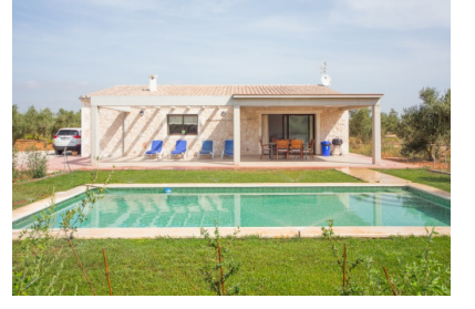
<mark>Миго</mark> Объект № 118360

PORTA MALLORQUINA® Your home. Our passion.