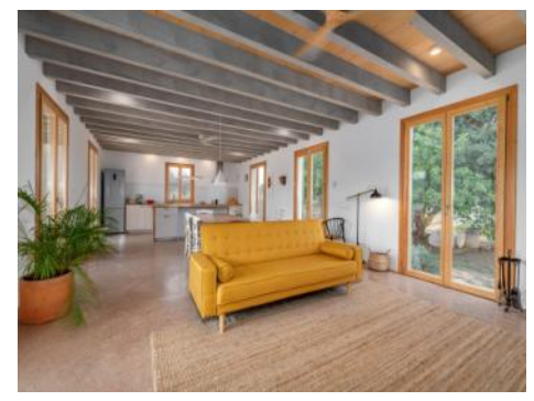
* Agency fee: 1.7 monthly rent plus 21% VAT Минимальный срок аренды – шесть месяцев