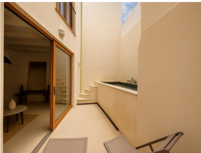
Patio with pool