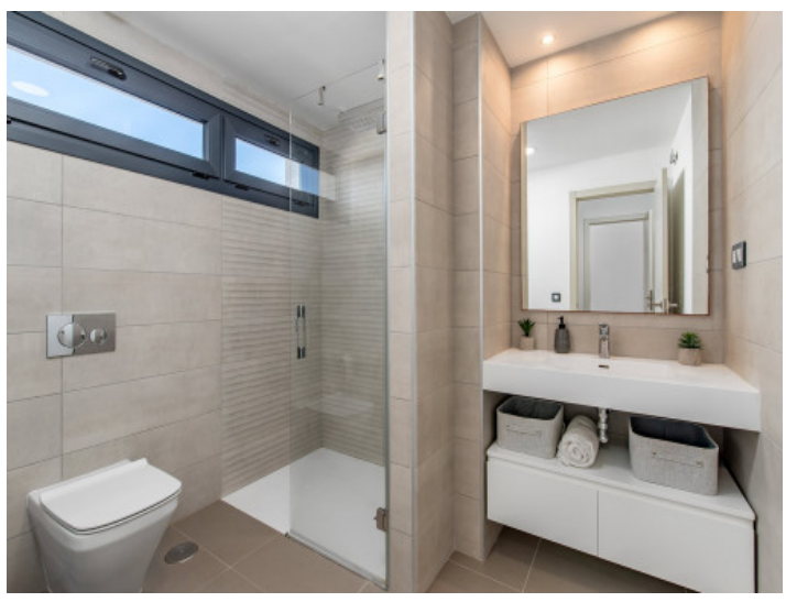
All information is correct to the best of our knowledge. Errors and prior sale excepted. This prospectus is purely for information purposes. Only the notarized deed of sale is legally binding.