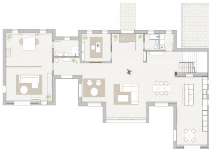
GROUND FLOOR PLAN E.176

All information is correct to the best of our knowledge. Errors and prior sale excepted. This prospectus is purely for information purposes. Only the notarized deed of sale is legally binding.