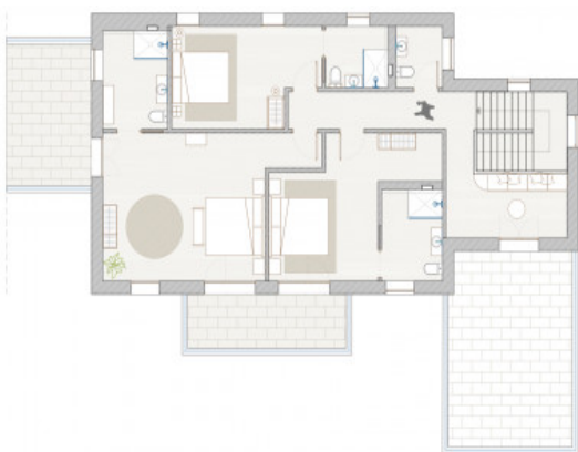
FIRST FLOOR PLAN E.175