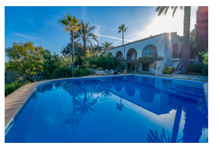
<mark>Видег</mark> Объект № 120157